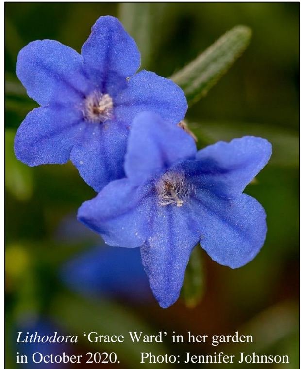
Lithodora 'Grace Ward' in her garden in October 2020.

This book has 5 sections: Planning the Garden, Building the Garden, All about Plants, Garden examples, Native Plant cultivar list. All aspects of Gardening are discussed from testing the soil to choosing garden art, and everything else. A must have for anyone planning a new garden or a garden makeover. Notes and illustrations of nearly 500 cultivars. ■