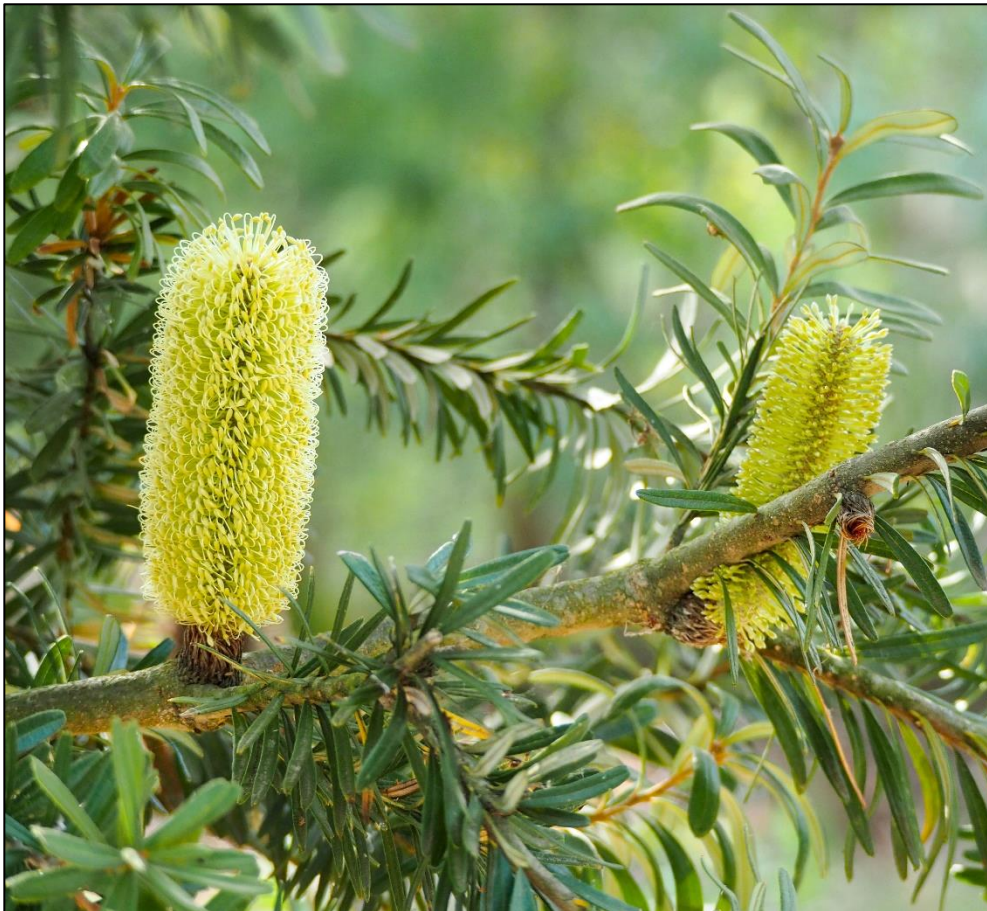
Planted Banksia marginata , growing in the North Gardens Wetlands near Lake Wendouree, seen on the February excursion.

Thanks to all those who contributed reports or items for this issue