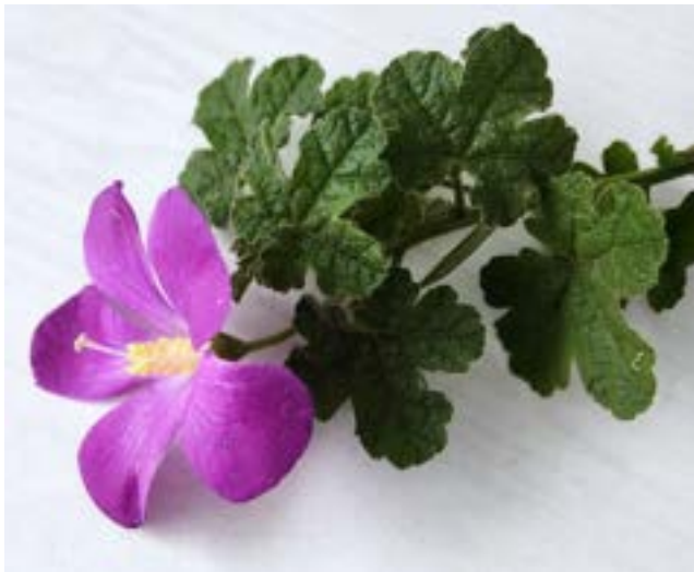
Alyogyne wrayae

According to Florabase, Alyogyne wrayae is an upright, spreading, spindly, shrub to 4m (H). Mauve, purple, blue or white flowers appear in May or from August to November. There is a cultivar of this, Alyogyne wrayae 'Blue Heeler', which is a low-growing, more compact form. This specimen looks like that cultivar. It grows 30-50cm (H) and 0.5-1m (W). Sunny position, in moist but well-drained soil.