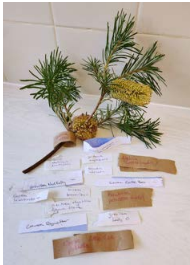
Bench plant labels

written name is also very helpful – you then know exactly what you will be trying to grow!