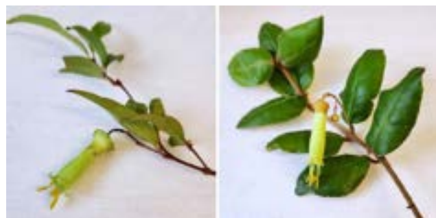
Correa bauerlenii Chef's Cap Correa; Correa lawrenceana

We had a couple of correas with interesting green to greenish-yellow flowers. While the following two shrubs may not have "Wow!" or "stop-in-your-tracks" flowers they have plenty to offer in terms of foliage interest, hardiness, and general landscape usefulness.