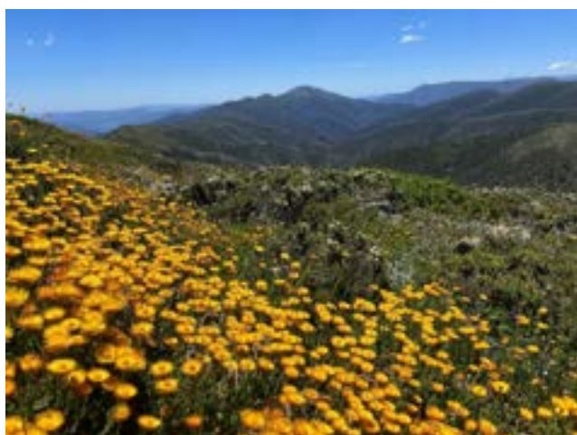
Wildflowers at Mt Hotham looking towards Mt Feathertop

What a treat to have Alex Stalder talk to us about her beloved High Country. We learned about vegetation zones and got to see different types of plants that we might not have seen in other presentations. Some plants are well known and fairly common, while many others are rare and/or endangered. Alex's enthusiasm for the mountains and the plants was clearly evident and we were spellbound right from the very first slide – a classic High Country view of mountains and wildflowers.