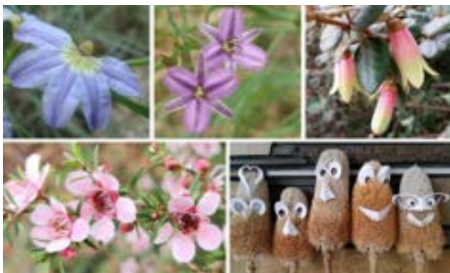
1 – 2 – 3 – 4 – 5

Yes, its “Five Slides” time again! Some of the rules and technical stuff has been updated from previous years. Please see page 3 for more details on how to contribute and join in the fun.