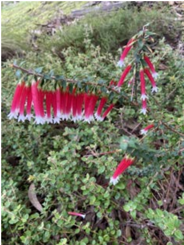
Epacris longiflora