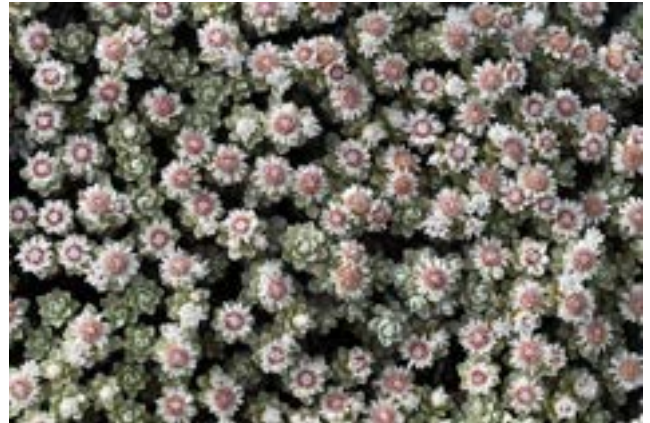
Ewartia nubigena Silver Ewartia or Australian Edelweiss

The Ewartia is a true alpine species, forming silvery grey carpets with tiny flowers only a few millimetres across. It's found in Mt Hotham and Falls Creek, and in other areas above the tree line and across the Bogong High Plains. It flowers in December-January but looks spectacular all year round.