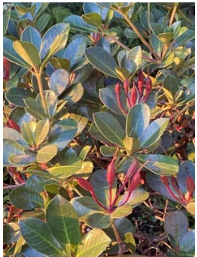
Seed pods of Rhodadendron lochiaie