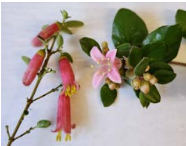
Correa 'Little Cate'; Correa 'Catie Bec'

Correas are starting to 'do their thing'. We had one of the 'Chimes' series of Correa and two lovely pink ones on the bench, Correa 'Catie Bec' and Correa pulchella 'Little Cate'.