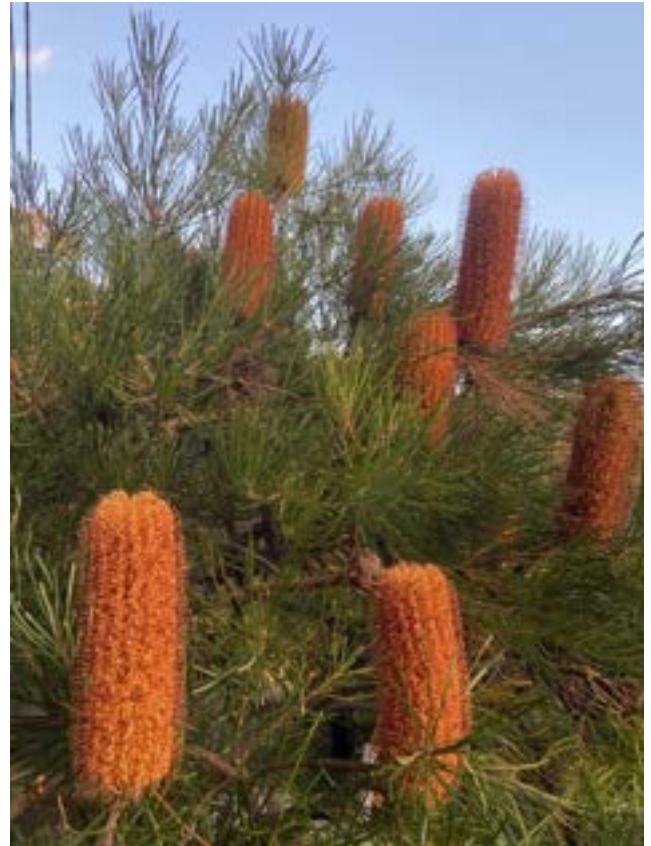
Banksia spinulosa

abundant and the beautiful Imperial White or Imperial Jezebel ( Delias harpalyce ), a large, colourful butterfly with red, yellow and black and a whitish blue on the outer side when in flight, were very active. Leptospermum petersonii (Lemon-scented Teatree) is listed as an adult food plant of which we have an enormous bush.