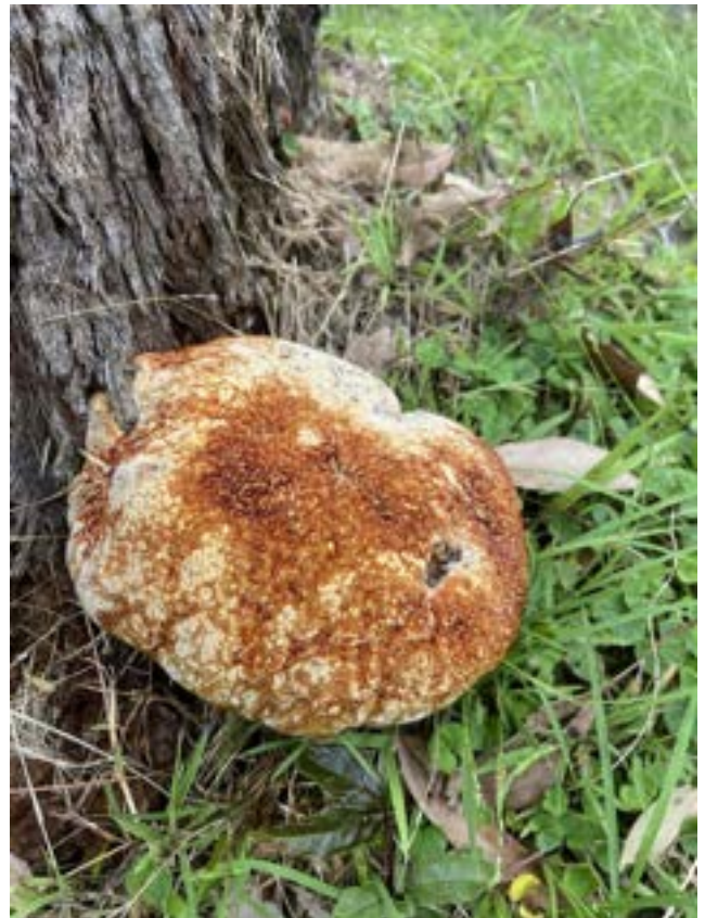
Bread Fungus

On my early morning walk in the garden, with foggy areas still spreading over Ferntree Gully, a pair of Scarlet Robins was busy feeding, flitting from branch to the ground. What a delight to see them again! That's another species with a long absence from our garden. The male is so bold and bright and the female so delicate with her dusky orange-pink breast.