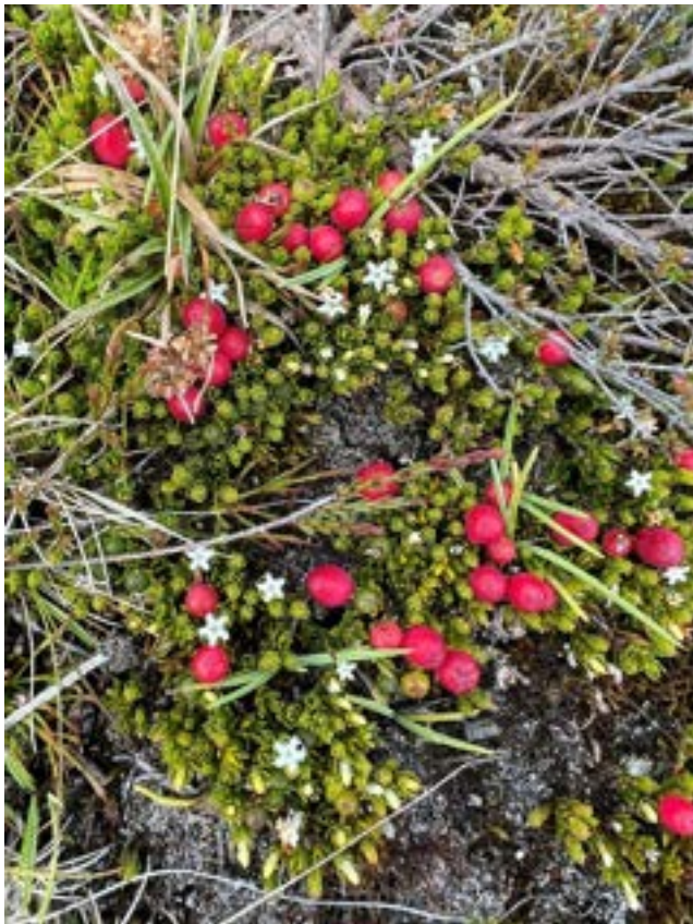
Pentachondra pumila Carpet Heath