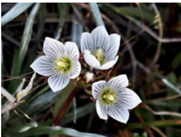
Gentianella muelleriana subsp. muelleriana Mueller's Snow-Gentian

The Snow-Gentian is one of the latest flowering species in the seasons and you'll find them in February/March.