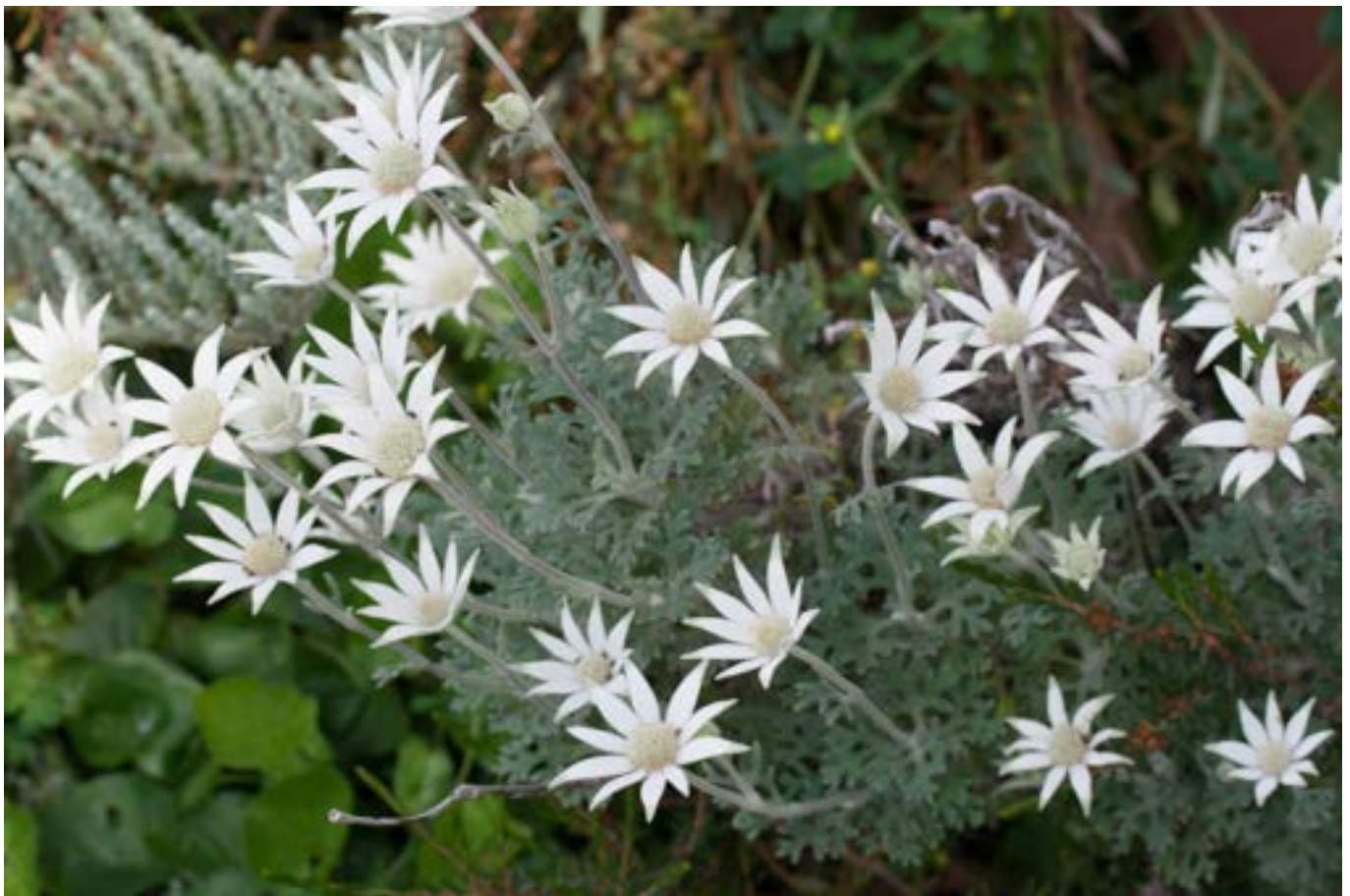
Actinotus helianthi