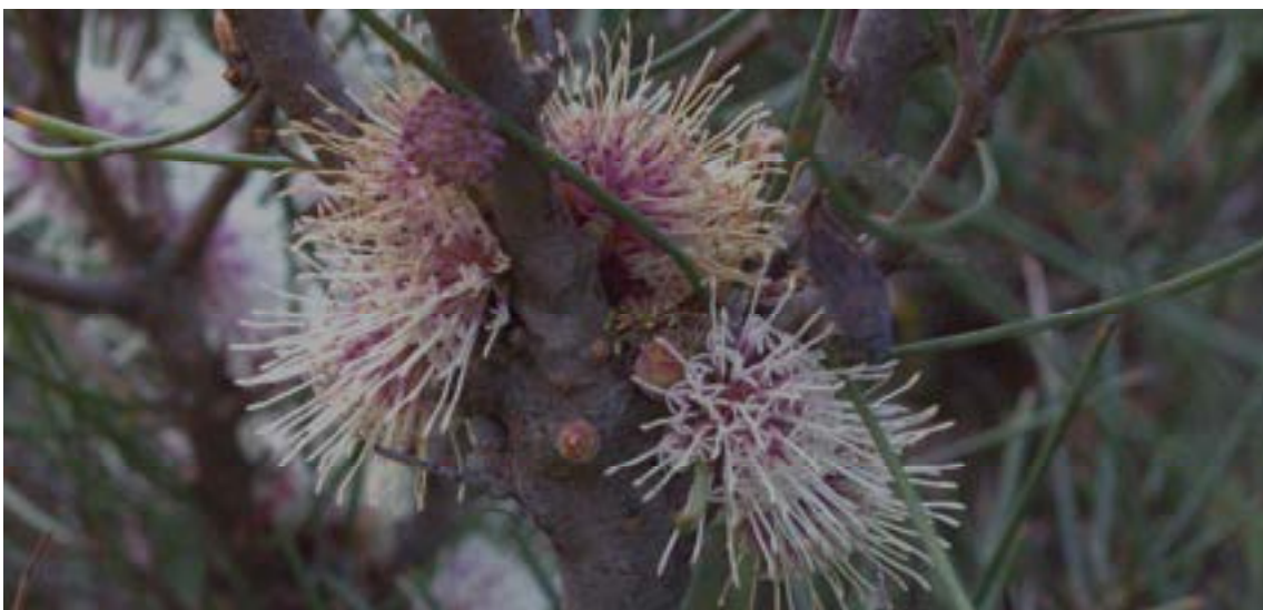
H. subsulcata in flower at Melton Botanic Garden