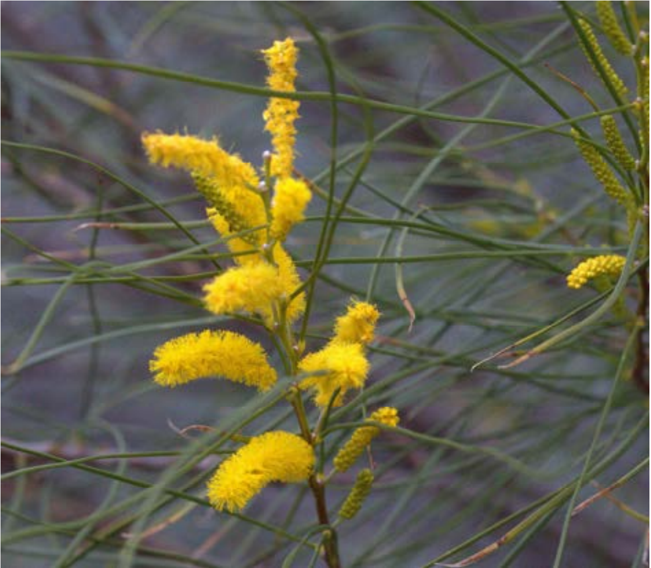
Acacia jibberdingensis – both frost and drought tolerant.

Australian Plant Society – Melton & Bacchus March Inc