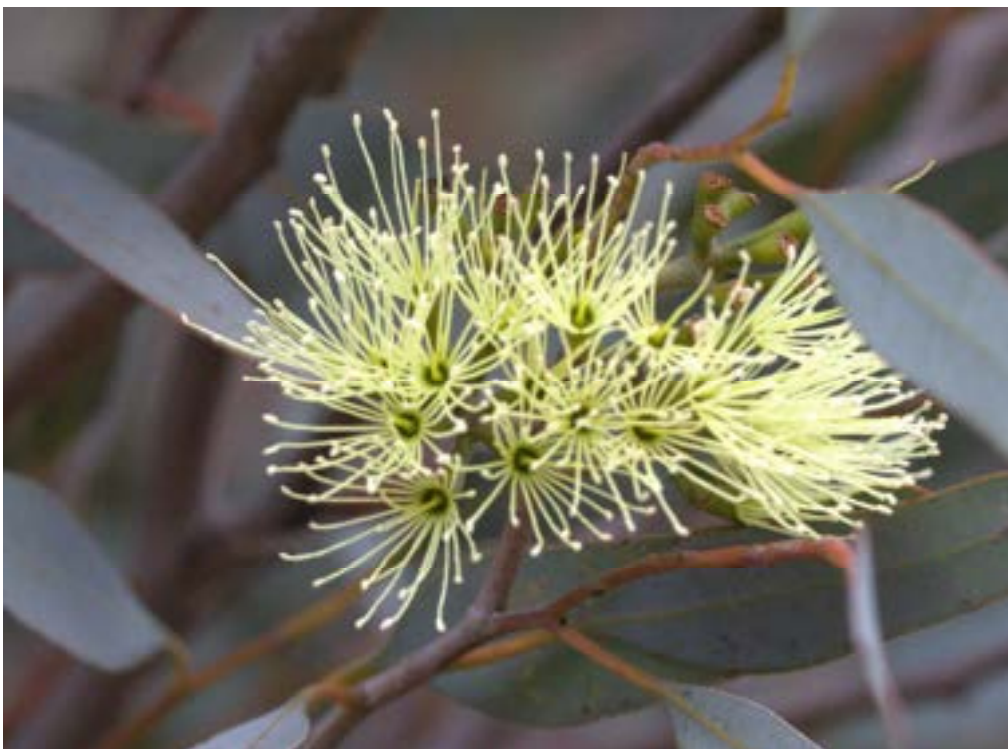
Eucalyptus pluricaulis ssp porphyrea