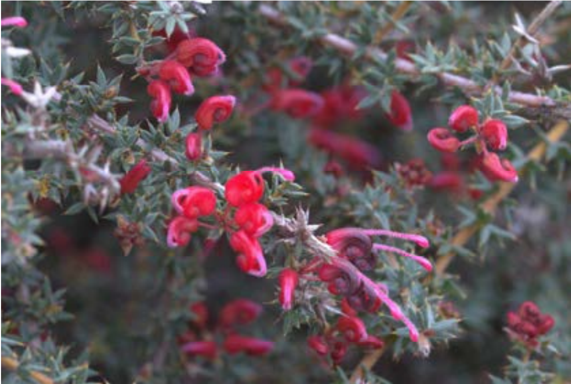
Grevillia asteriscosa – listed as critically endangered