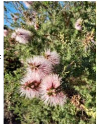
Kunzea baxteri pink form