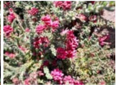
Grevillea chance garden seedling.