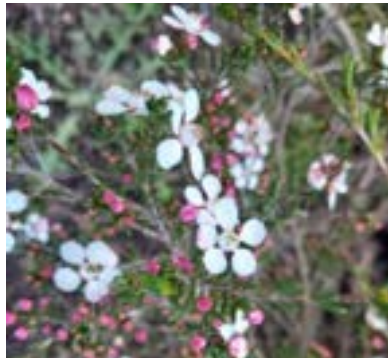
Possibly a Baeckea sp.