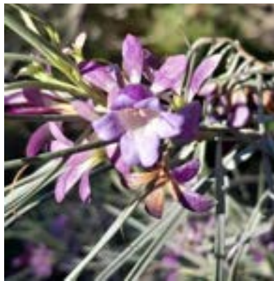
Eremophila oppositifolia subsp. oppositifolia 'Ray's Blue'.