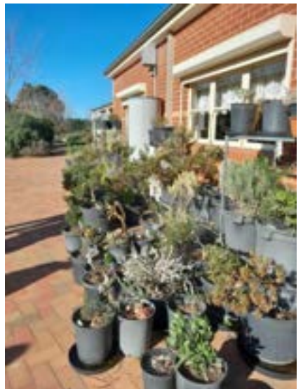
Russell's potted collection.