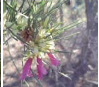
Eremophila oppositifolia subsp. oppositifolia