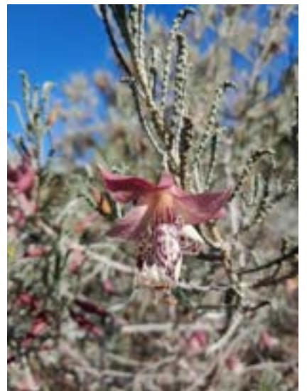
Eremophila mirabilis