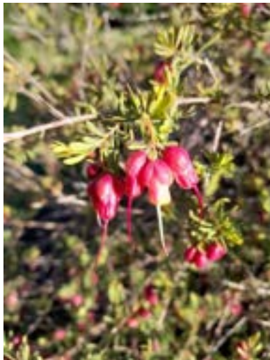
Possibly Homoranthus porteri