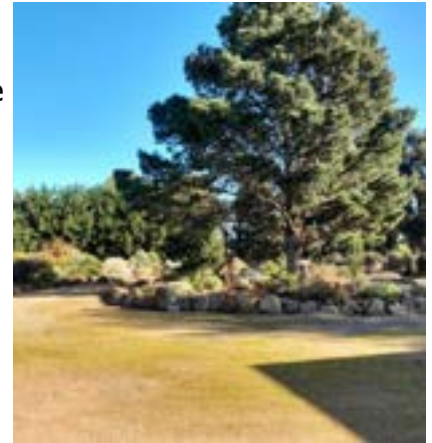
View of driveway garden bed at "Eremophila Park".

Eremophila platycalyx is a quite a variable species with a