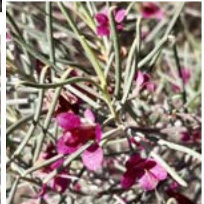
Eremophila oppositifolia subsp. angustifolia