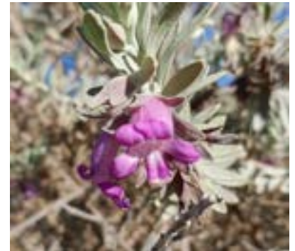
Eremophila compacta subsp. compacta