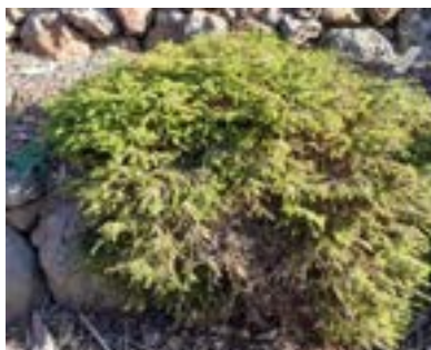
Eremophila barbata prostrate form in garden.