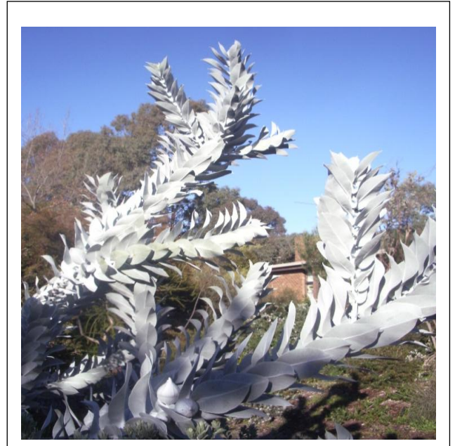
Mottlecah – stunning contrasting silver-grey foliage

Gum trees - Eucalypts are undeniably Australian. They occur east of 'Wallace's Line'; a map demarcation running south from the northern Philippines, through Indonesia and West of Australia. About 900 different species have been identified.