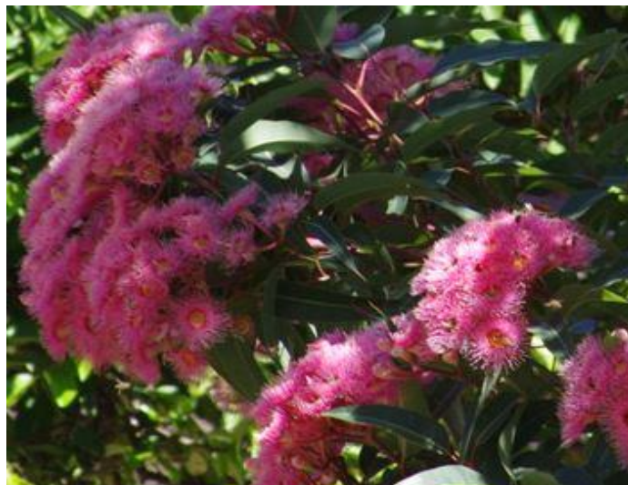
Corymbia Ficafolia flowering on Orchard Drive Glenrowan

Australian Plants Society Wangaratta would like to thank Park Lane Nursery for their continuing generosity and support, allowing APS Wangaratta the use of their meeting room and propagating area for meetings and propagating workshops. Our members greatly appreciate this