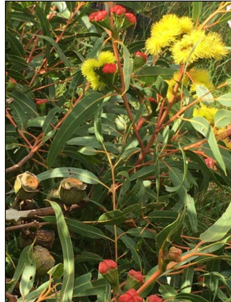
Currency Creek Eucalyptus Arboretum

right: Red-capped Gum - Eucalyptus erythrocorys