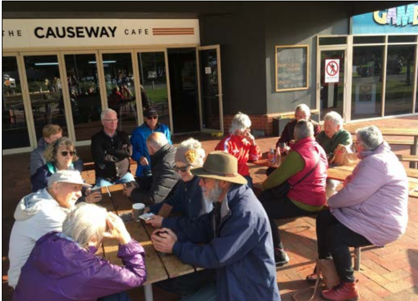
It was a beautiful eclectic garden to suit her beautiful period home. Those who had time had a lovely cuppa.