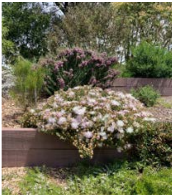
Garden bed, Caprobrotus sp. mid level, Chamelaucium x verticordia 'Paddy's Pink' shrub behind.