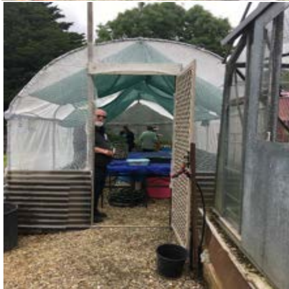
Ray Weeks and other members checking out the plants in the shade tunnel.