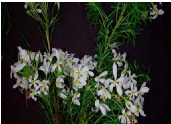
Ricinocarpus pinifolius (DC)