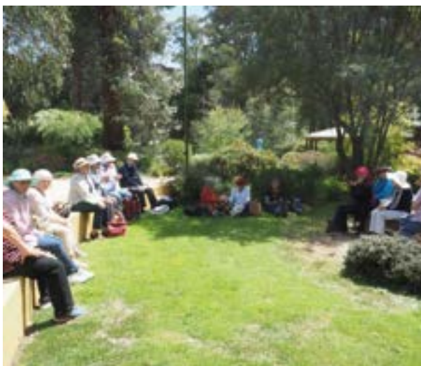
The YY group having lunch at Karwarra Gardens