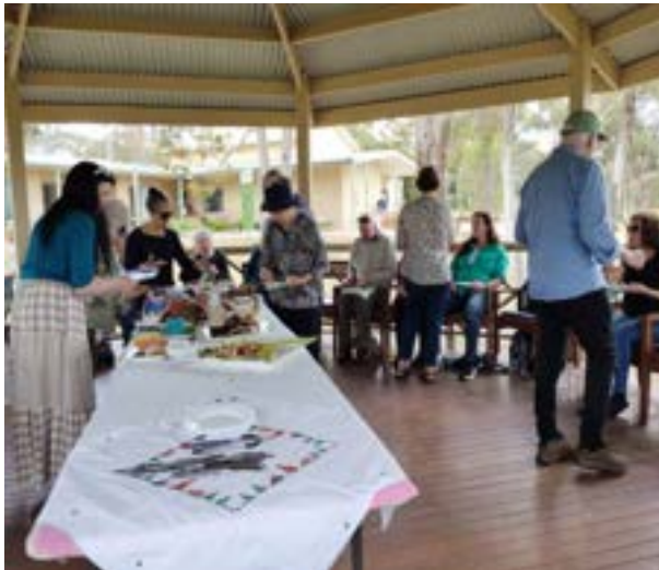
Members enjoying lunch.