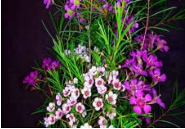
Chamelaucium uncinatum (DC)