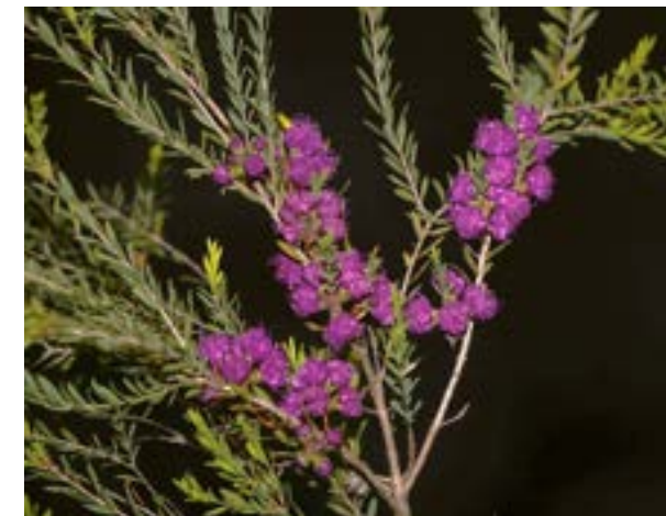
Meleleuca thymifolia (BE)