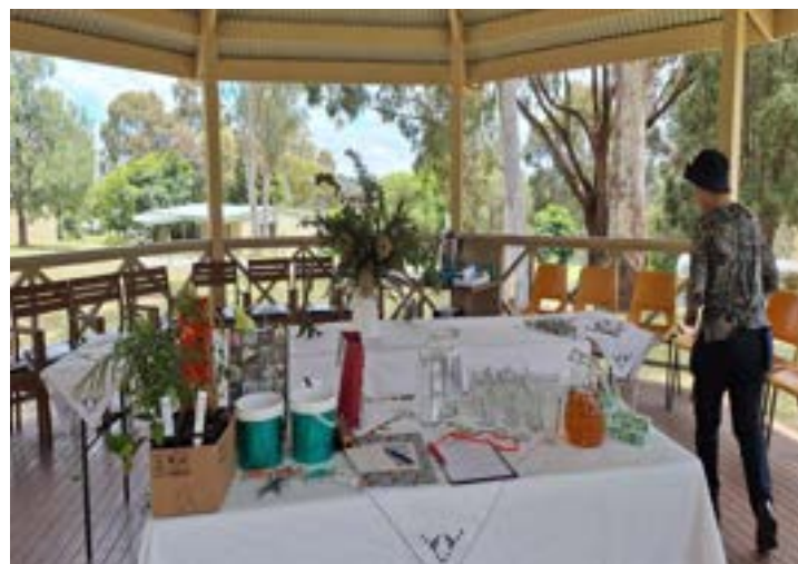
Lovely table preparation (AM)