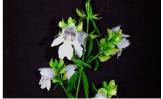
Prostanthera striatifolium (DC)