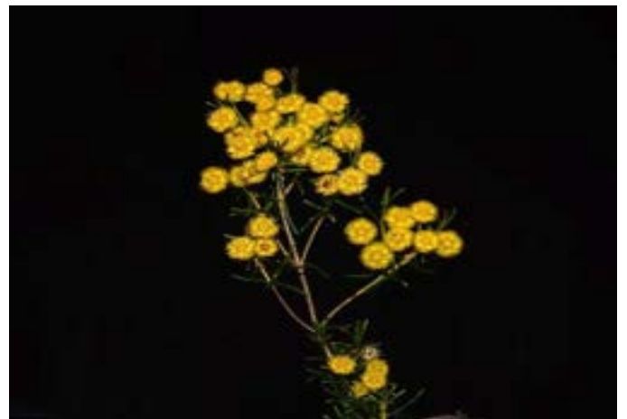
Verticordia chrysantha (BE)