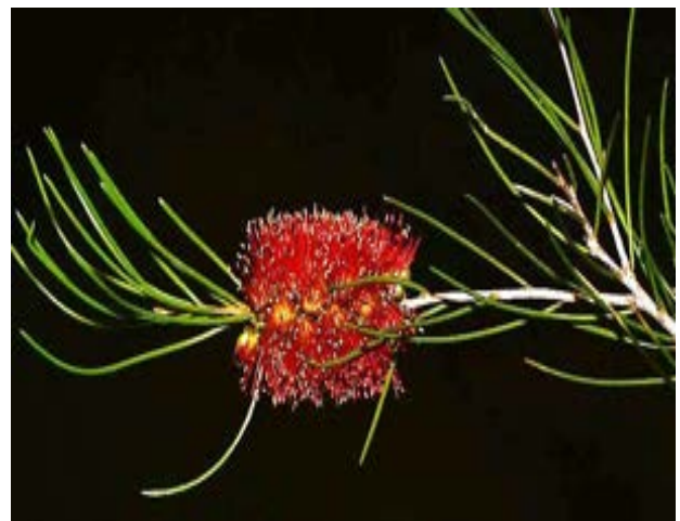
Callistemon teretifolius (BE)