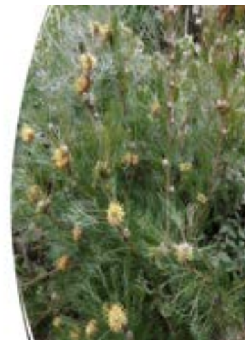
Isopogon 'Coaldale Cracker'

It was an eye-opening and informative introduction to these very showy plants and we thank Catriona and Phil for their time and sharing their knowledge with our group.