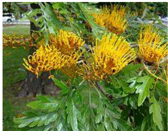
Grevillea robusta