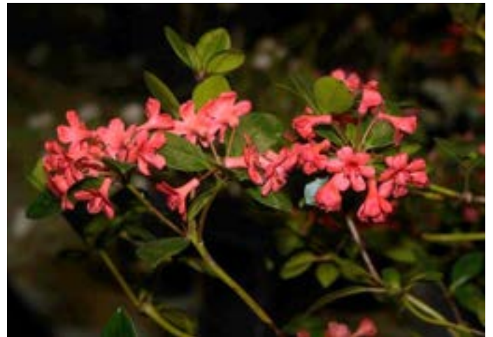
Rhododendron lochiae or variosum hybrid (BE)