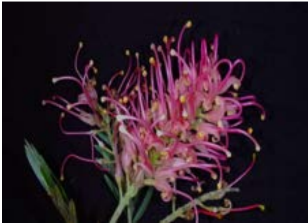
Grevillea banksii x nana 'Miami Pink' (DC)