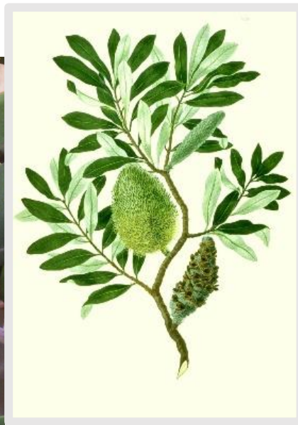
Banksia integrifolia "Roller Coaster"